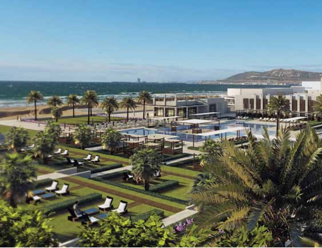
Hotel overview - artist impression