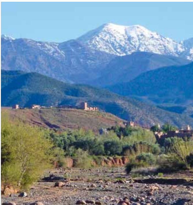
Kasbah Angour (p18)

Spend 3 nights at Hotel Es Saadi (page 35) in Marrakech and 4 nights at Sofitel Agadir RoyalBay Resort (page 44) in Agadir. Prices from £824 per person including flights and private transfers (approximately 3 hours between locations).