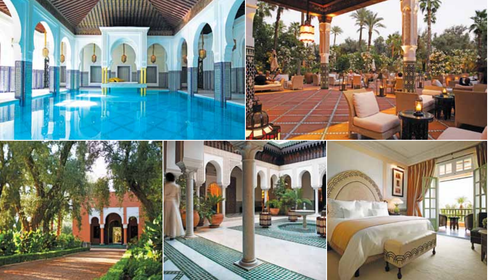
Clockwise from top left: indoor pool, esplanade majorelle, deluxe park room, courtyard, le menzeh pavilion in the garden