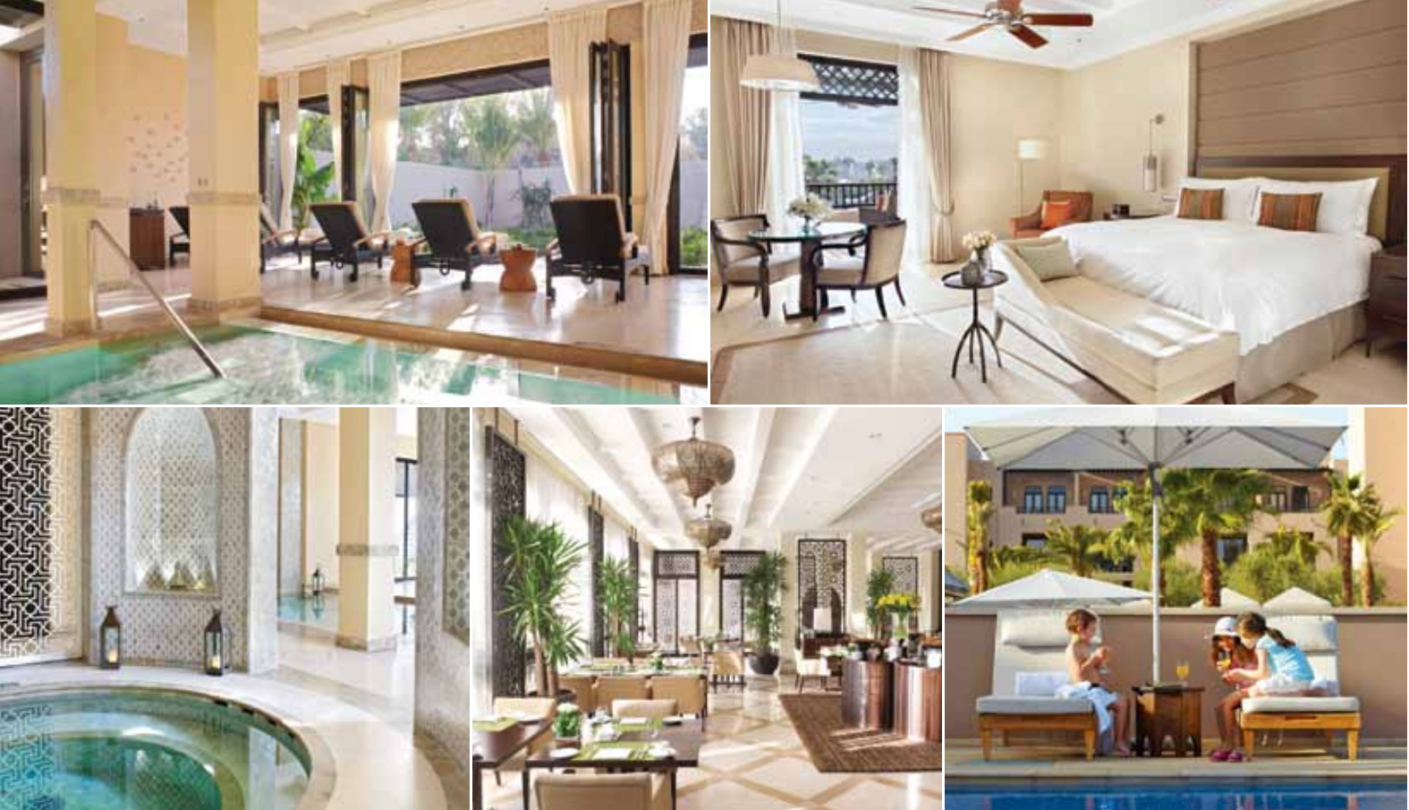
Clockwise from top left: spa wet area, Pavilion room, family pool, Solano Brasserie, spa plunge pool

“ LUSH WALLED GARDENS SURROUND STYLISH SIGNATURE LUXURY ”