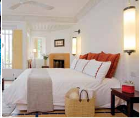
Les Solariums room with rooftop terrace