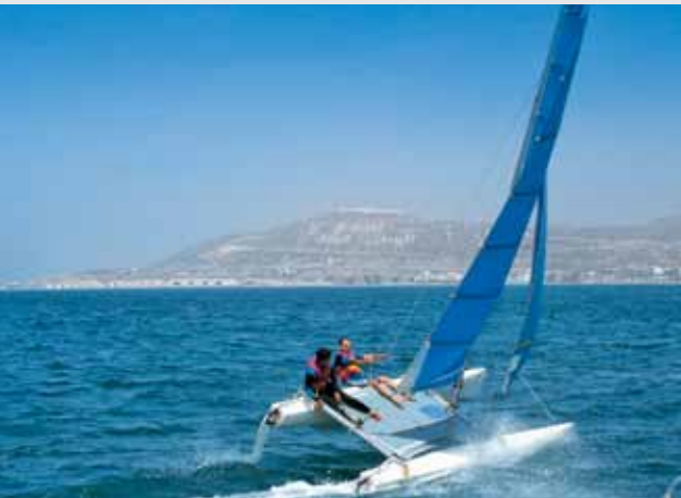
Clockwise from top left: Amelkis Golf Club, traditional mint tea, Kasbah Bab Ourika (p20), watersports in Agadir, shopping in Marrakech