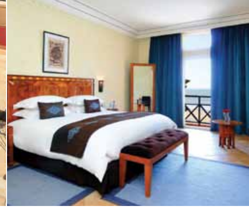
Superior double ocean view