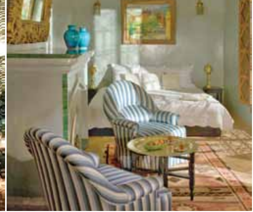
Double prestige room