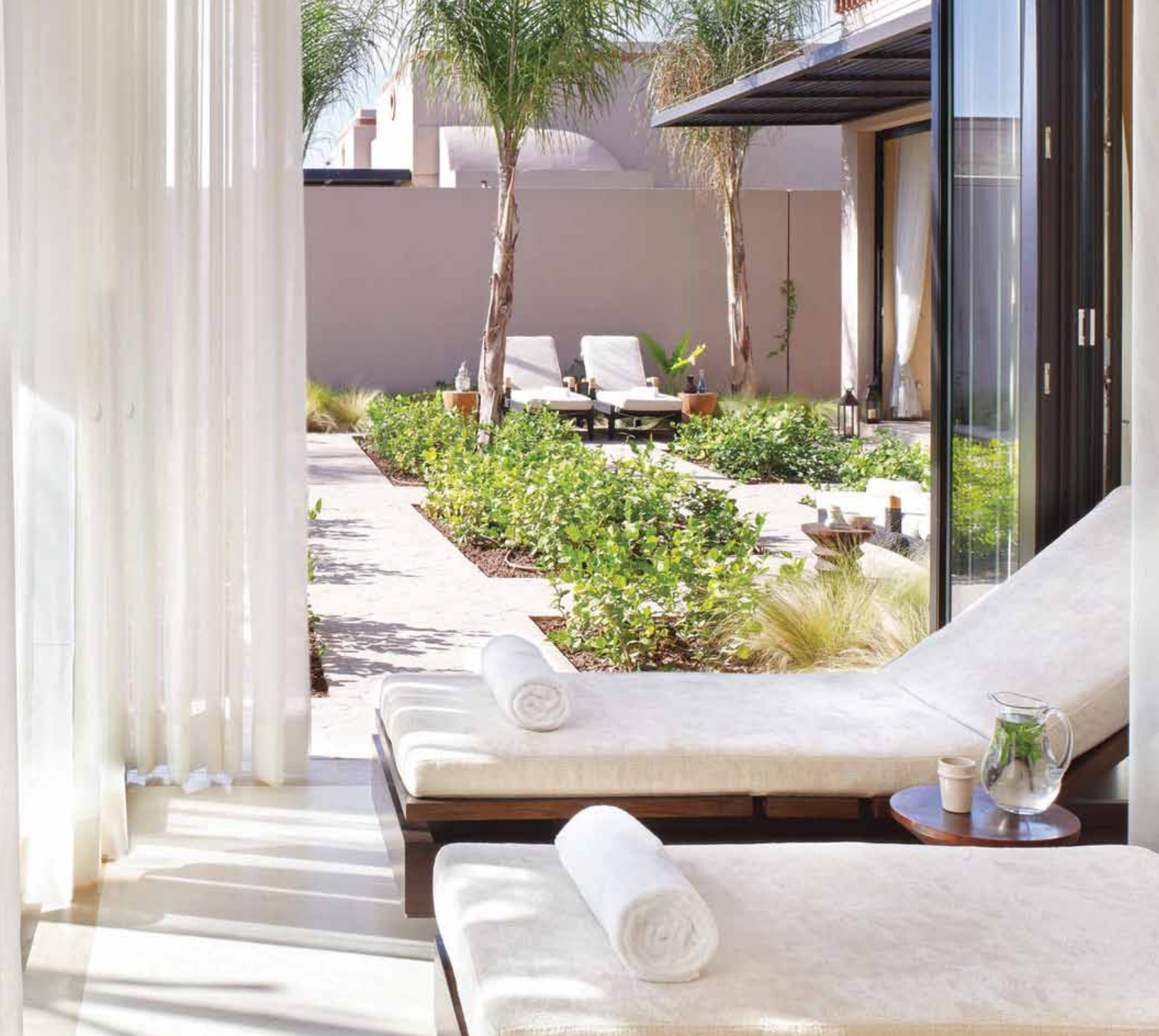
Four Seasons Resort Marrakech (p30-31)