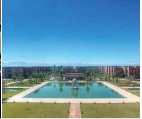
Riad palace palmerie room