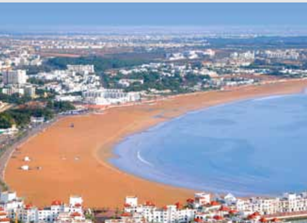
Clockwise from top left: Menara Gardens in Marrakech, traditional musician, Essaouira, Agadir bay, Kasbah Tamadot (p19)