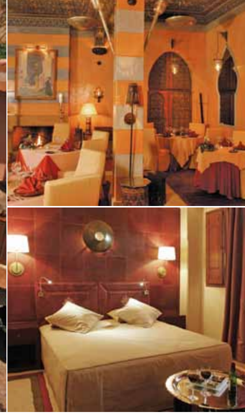
Deluxe room garden view