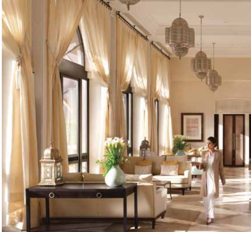
Four Seasons Resort Marrakech (p30-31)