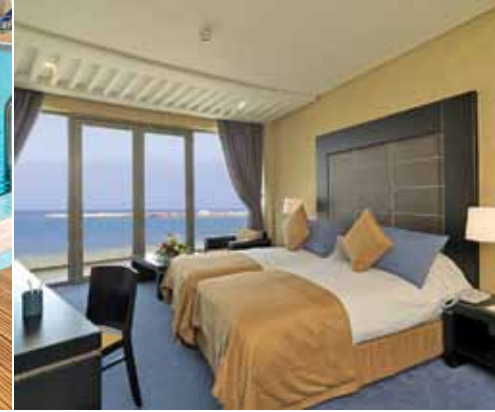
Premium room with ocean view