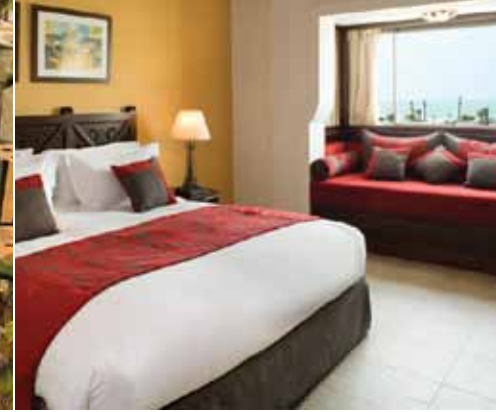
Luxury room with ocean view