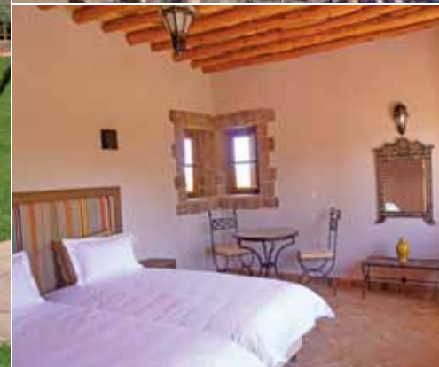
Adrar twin room