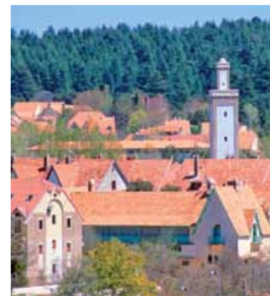
From left: Meknes, Koutoubia Mosque in Marrakech, Ifrane

PLEASE NOTE Tour details are correct at time of brochure printing, the itinerary may be subject to alteration. Private tours are based on a minimum of 2 passengers and include transport by air conditioned cars and English speaking driver/guide. Full board accommodation (continental breakfast, light lunch and 3 course dinner, excluding drinks) is included and, although enjoying 5 star status, some hotel facilities may be less sophisticated than denoted by their official rating. Entrance to some sites will be payable locally.