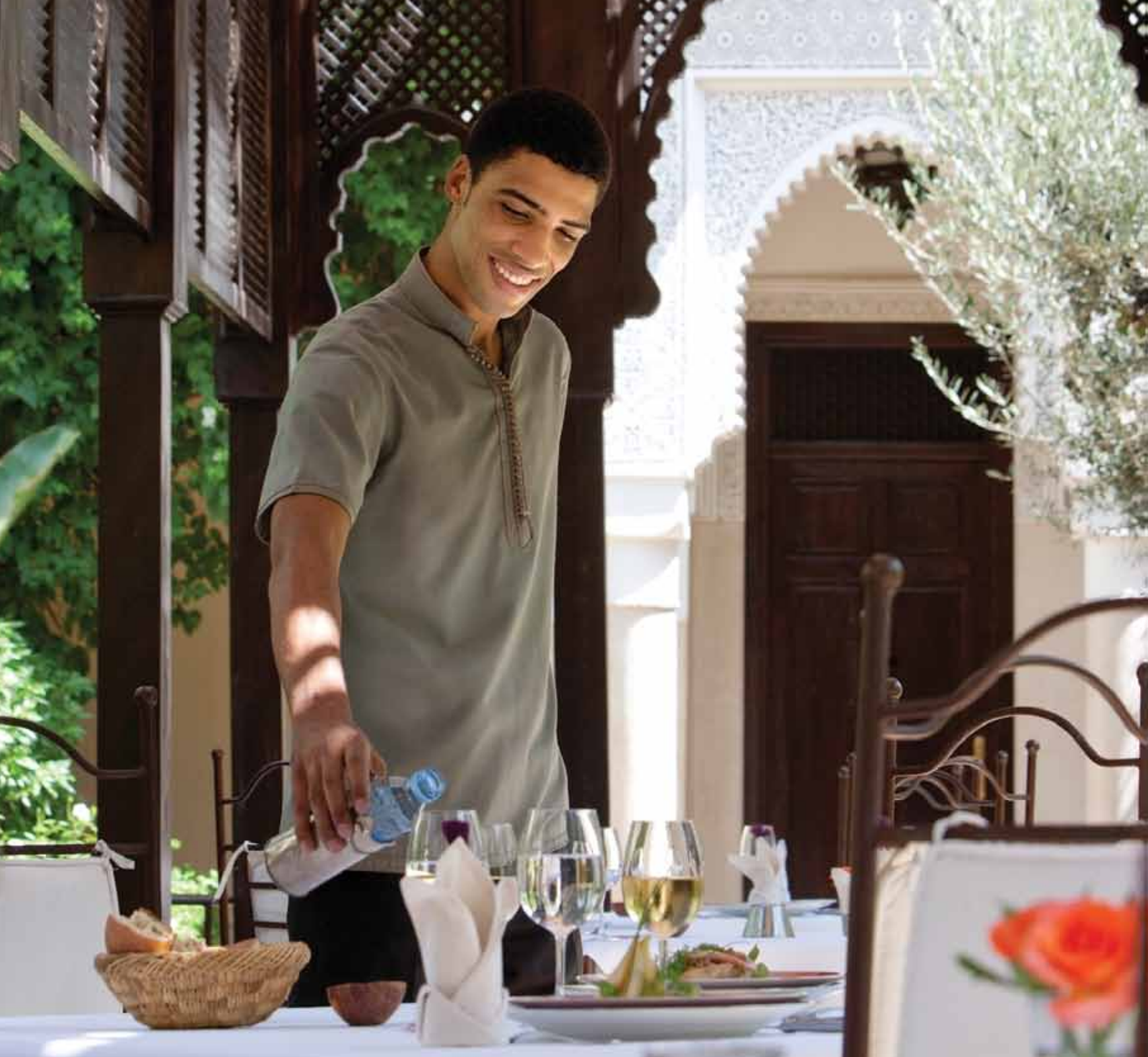
Villa des Orangers (p20)