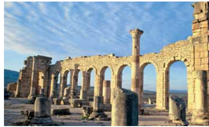
From left: Djemaa el Fna square musicians in Marrakech, the Chella in Rabat, Volubilis