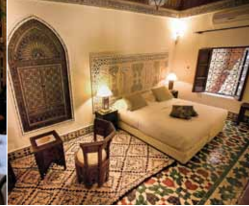
Double deluxe room