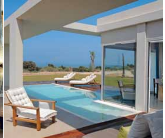
Clockwise from left: restaurant, double superior room, villa with pool, lobby, hammam lounge