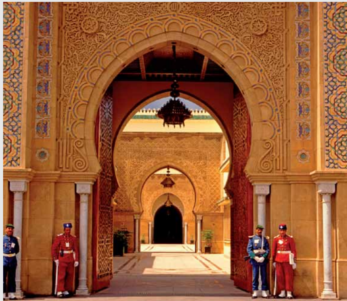
Clockwise from top left: Oudayas in Rabat, Fes tanneries, Royal Palace in Rabat, Bab Mansour in Meknes, Hassan II Mosque in Casablanca