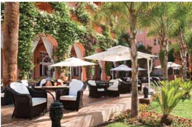
Sofitel Marrakech Palais Imperial (p32)

So that you can sample the local restaurants, but still have the option of pre-booking your evening meal in the hotel for some nights, take advantage of our flexible dining plan. You can book as many, or as few, evening meals in the hotel as you wish and you don't even have to tell us for which nights until you arrive at the hotel. Prices for dinner are detailed as half board supplements on each hotel page. Some hotels offer an all inclusive package to include meals, drinks, children's clubs and non-motorised sports. Please do check with us carefully as to what is actually included.