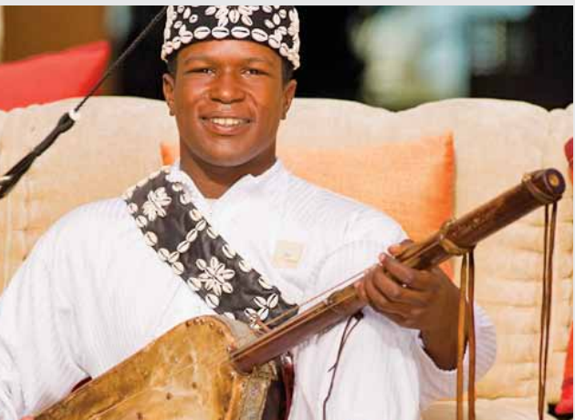
Clockwise from top left: Marrakech medina, desert sands, Villa des Orangers (p20), traditional musician, Four Seasons Resort Marrakech (p30-31)