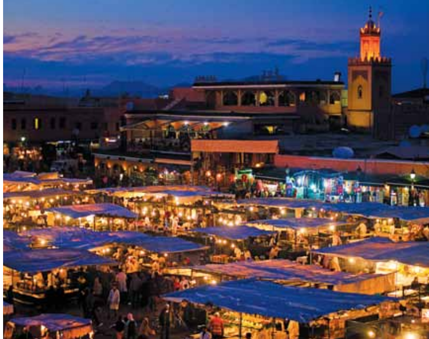
Djemaa el Fna Square, Marrakech