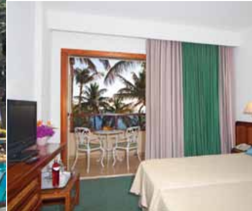
Twin room with ocean view