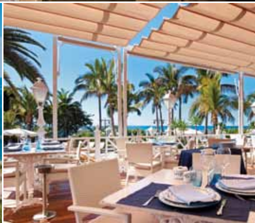
Clockwise from top left: infinity pool, standard double room with ocean view, beach club restaurant, beach, spa pool