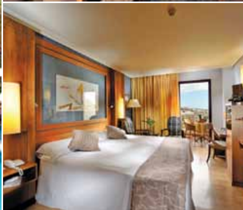
Double room with side ocean view