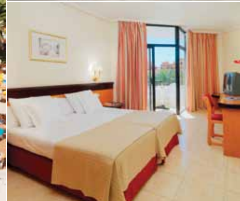
Double room with pool view