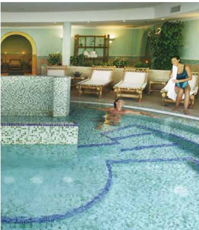
Hotel Volcan Lanzarote (p82-83)

The Hesperides Thalasso Spa at Sheraton Fuerteventura Beach Golf Resort & Spa in Caleta de Fuste combines ancient therapies with modern techniques in a spa area that has been likened to a palatial heaven: and additional to normal luxury spa experiences there's a roman suite, a pebble walkway and a juice bar.