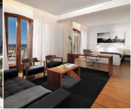
Junior suite city view (all images artist impressions)