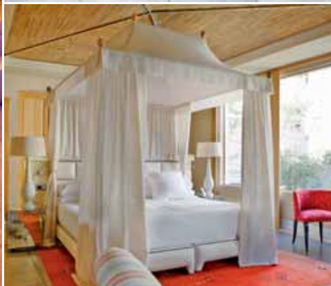
Las Mimosas bedroom