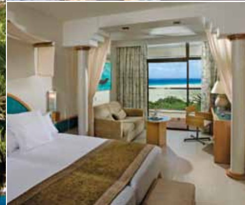
Twin room with ocean view