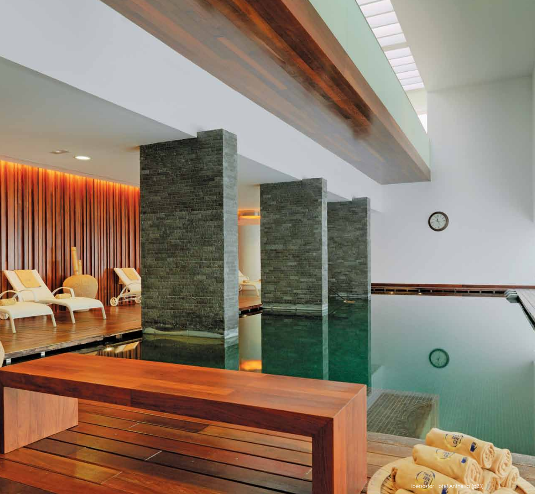
Ibersostar Hotel Anthelia (p33)