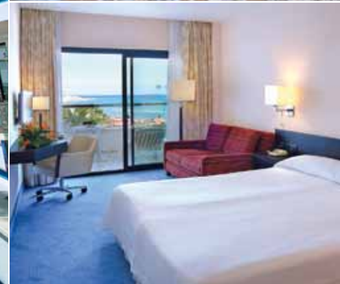
Double room with sea view