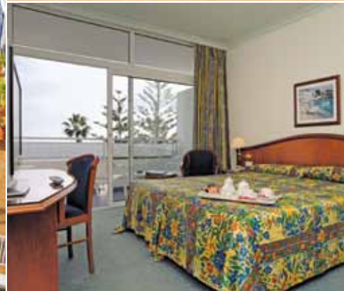
Double room with ocean view