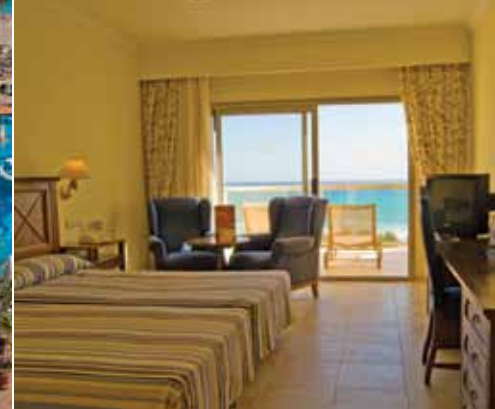
Twin room with ocean view