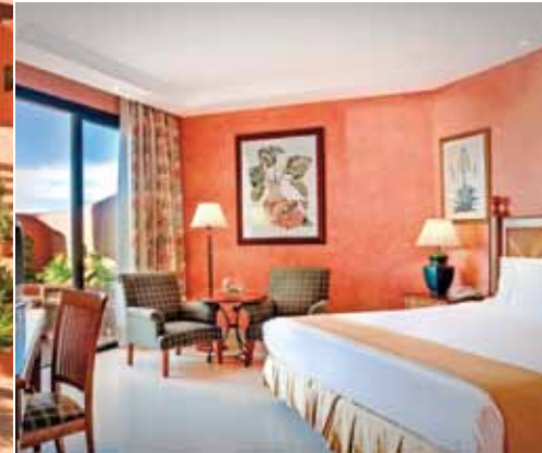
Deluxe room with ocean view