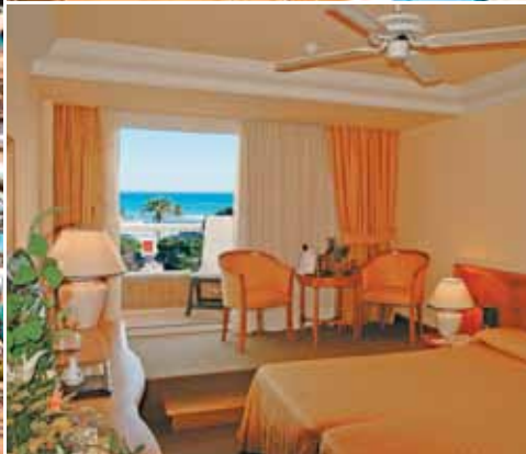
Ocean facing twin room