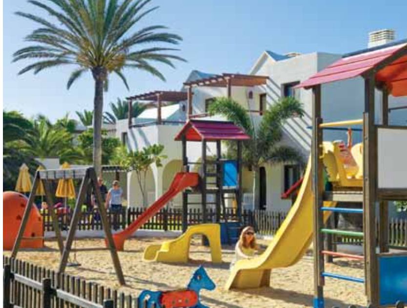
Suite Hotel Atlantis Fuerteventura Resort (p73)

Villas and hotel villas providing self catering freedom for Classic guests include Las Villas Gran Hotel Bahia del Duque and Royal Garden Villas on Tenerife and Villas Heredad Kamezi on Lanzarote, and we are also happy to especially recommend one of our hotels in Playa Blanca, Lanzarote, Princesa Yaiza (pages 80-81) which although sold on a bed and breakfast basis includes some (albeit limited) kitchenette facilities (and family suites feature a refrigerator and microwave). The hotel is perfect for families especially with young children as the on-site Kikoland boasts sports facilities and clubs for children aged up to sixteen. Please call us for advice, details and prices.