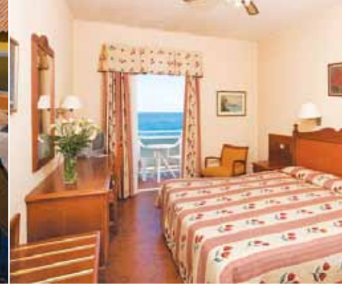
Twin room with balcony