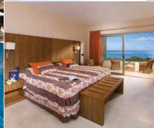
Double room with ocean view