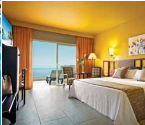
Double room with ocean view