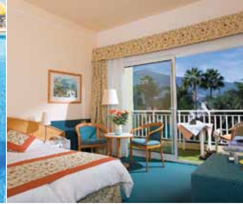
Double room with Mount Teide view