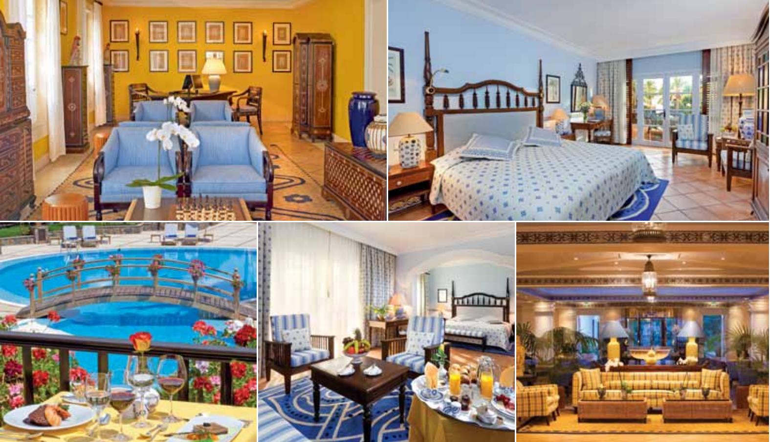
Clockwise from left: library, double room with garden view, lounge area, junior suite, restaurant terrace