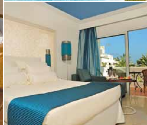
Double comfort room with ocean view

hotel loyalty good for golf ideal for families