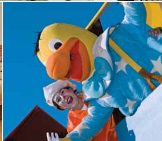
Clockwise from top left: view from beach, restaurant, Kikoland, family suite bedroom, thalasso and spa pool