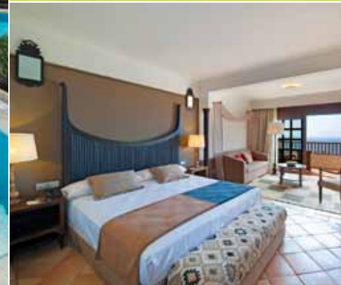
Superior double room with ocean view