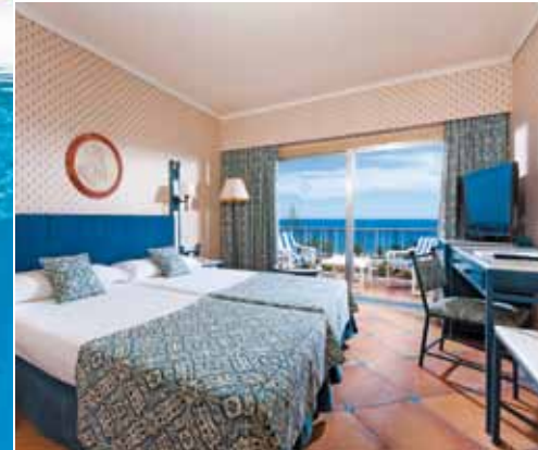
Twin room with ocean view