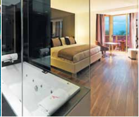
Superior room with ocean view