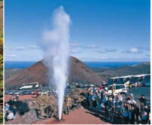
Main and bottom small images courtesy of Turispaña Spanish Tourist Office