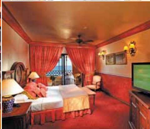
Double room with ocean view