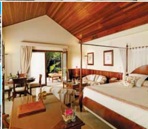
Clockwise from top left: garden villas overview and pool, twin room with ocean view, garden villa, main pool, lobby

“ TRADITIONAL CHARM AND EXCELLENT SERVICE ”