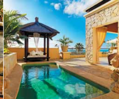
Grand duchess villa