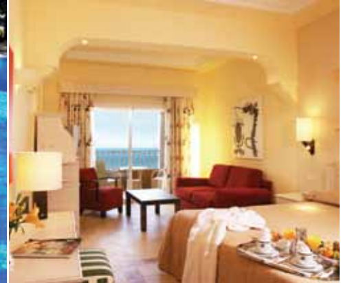
Double room with ocean view