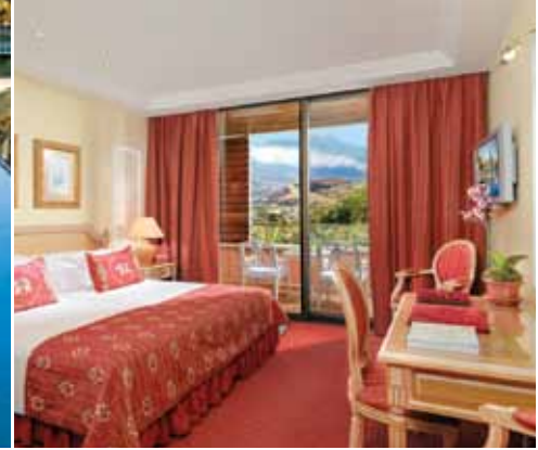
Deluxe room with Mount Teide view