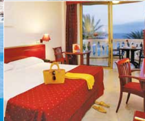
Double room with ocean view