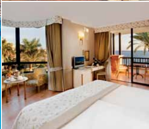
Executive room with ocean view