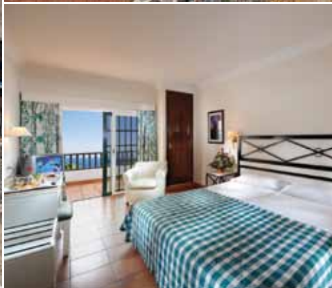
Superior room with ocean view