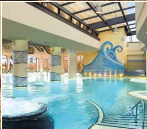
Clockwise from top left: hotel exterior, terrace, indoor spa pool, deluxe room with ocean view, royal suite