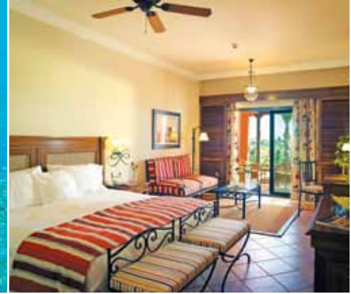
Deluxe double room with ocean view