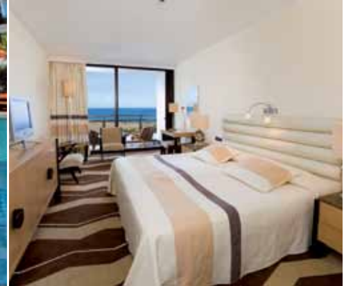
Standard double room