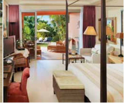
Villas deluxe room