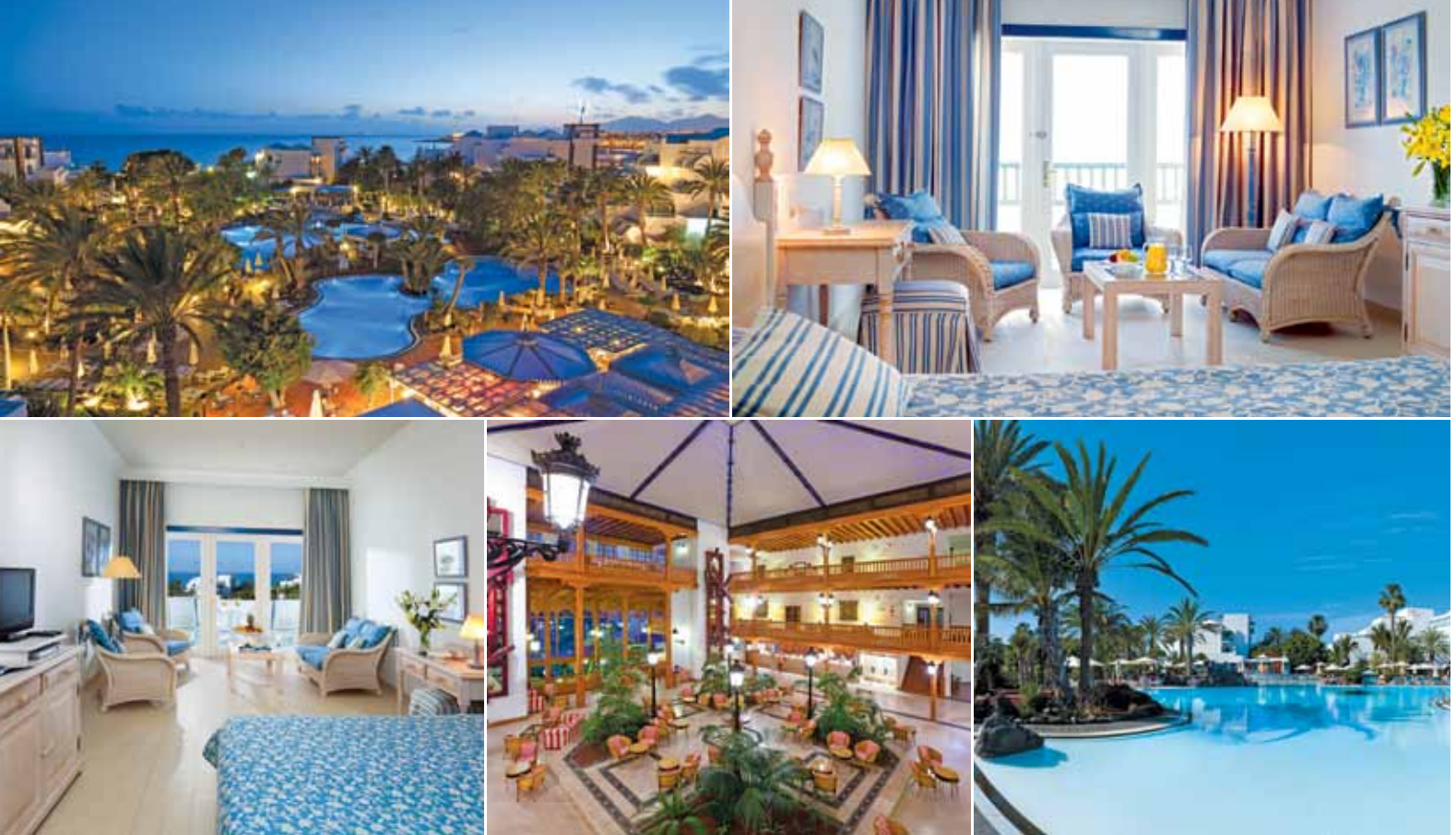
Clockwise from left: view of hotel at night, junior suite, pool, hotel lobby, junior suite