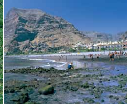
Main and small beach images courtesy of Tenerife, Spanish Tourism Office