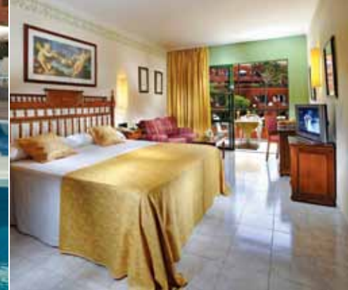
Double pool side room