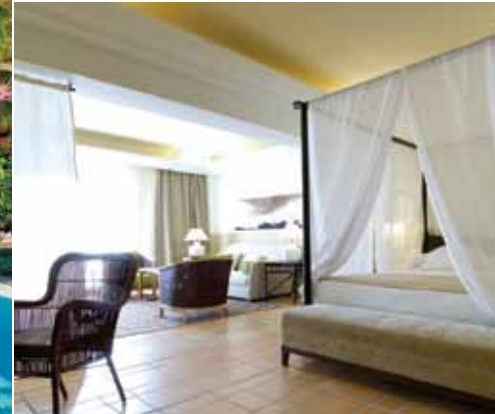
Junior suite with ocean view