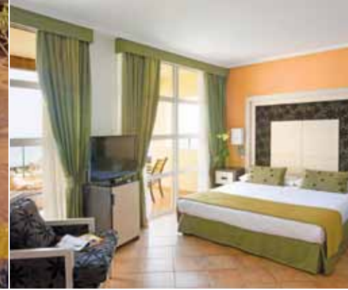
Double privilege room with ocean view