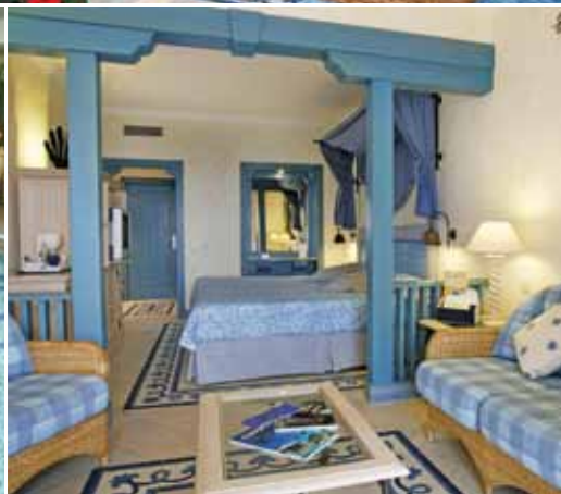
Clockwise from top left: Club Volcan pool, junior suite, double room, indoor pool, La Florida restaurant

“ SPECTACULAR VIEWS FROM THE SOUTHERN TIP OF THE ISLAND ”