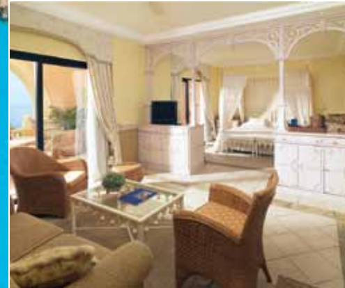
Balconada VIP pool