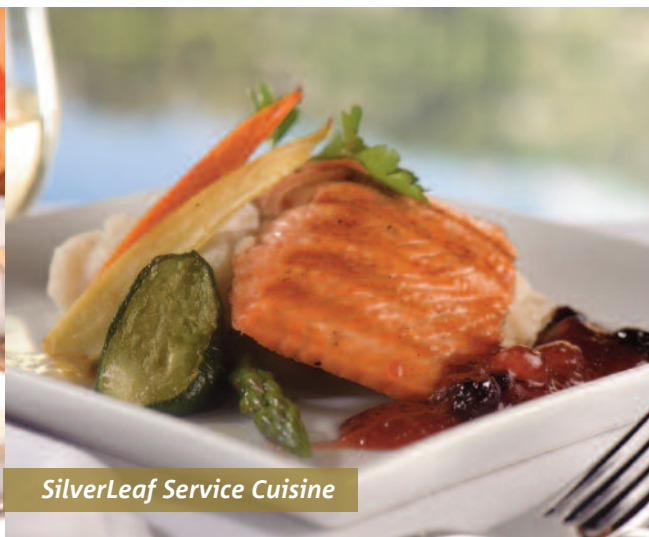
SilverLeaf Service Cuisine