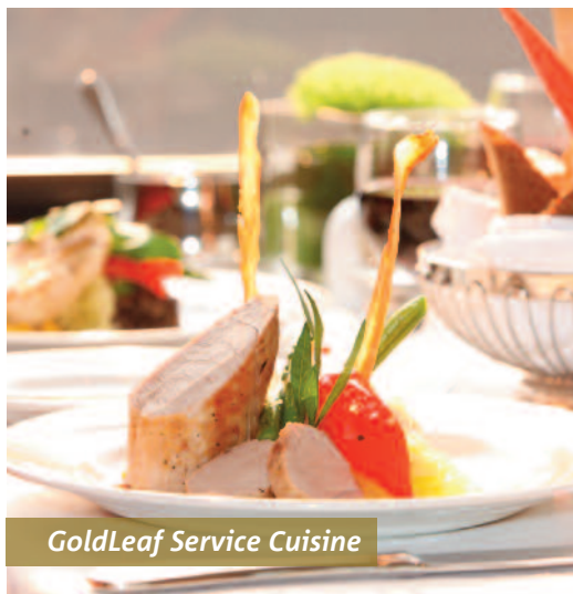
GoldLeaf Service Cuisine