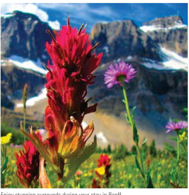
Enjoy stunning surrounds during your stay in Banff