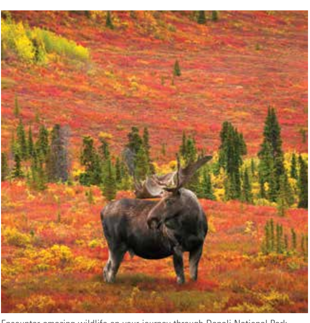
Encounter amazing wildlife on your journey through Denali National Park

| Talkeetna | Denali National Park | Fairbanks