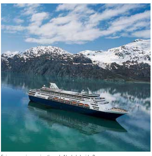
Enjoy a premium cruise through Alaska's Inside Passage