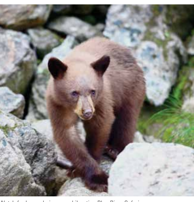
Watch for bears during an exhilarating Blue River Safari